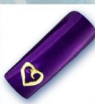
P015 - R550