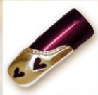
PN806 - R850

Habbil is a proven and effective learning tool & training instrument for all Professional Nail Technicians & Educators. Research shows that practice, persistence & good schooling are required to achieve perfection. Habbil allows for intensive & effective training.