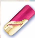
PN801 - R850